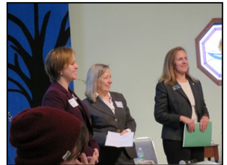
Staff members for Sen. Portman, Sen. Brown and Rep. Kaptur.